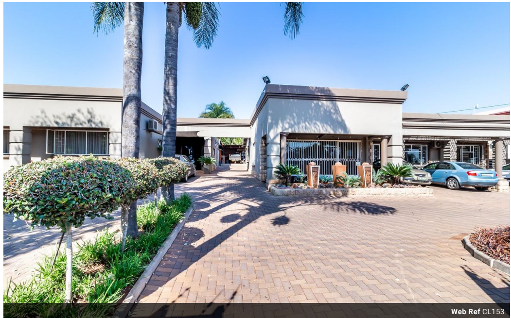
Web Ref CL153

5 Portofino, 753 Old Farm Road, Faerie Glen Pretoria