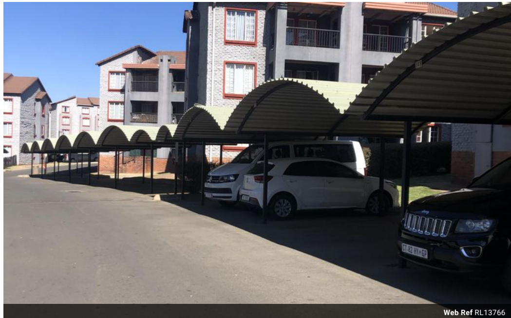
Web Ref RL13766

5 Portofino, 753 Old Farm Road, Faerie Glen Pretoria