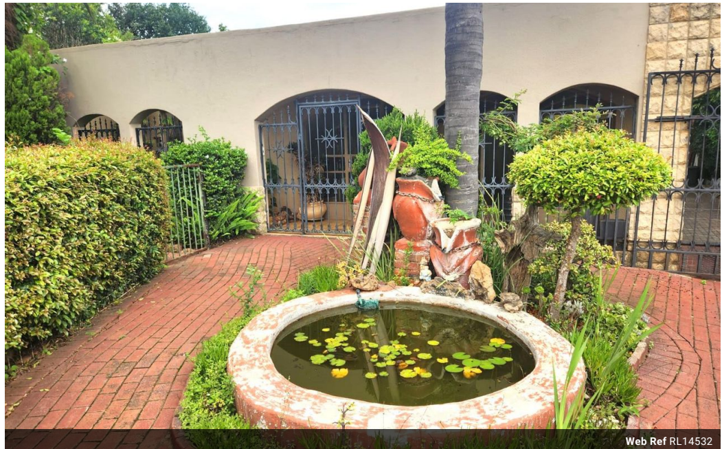
Web Ref RL14532

5 Portofino, 753 Old Farm Road, Faerie Glen Pretoria