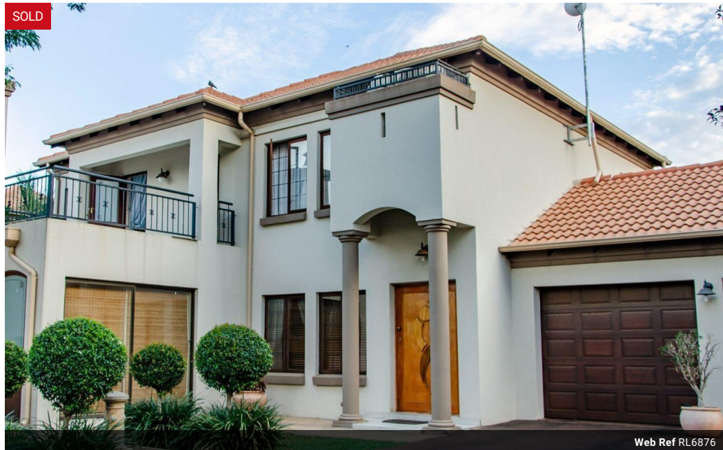
Web Ref RL6876

5 Portofino, 753 Old Farm Road, Faerie Glen Pretoria