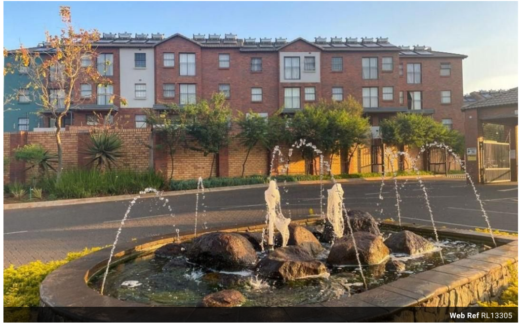
Web Ref RL13305

5 Portofino, 753 Old Farm Road, Faerie Glen Pretoria