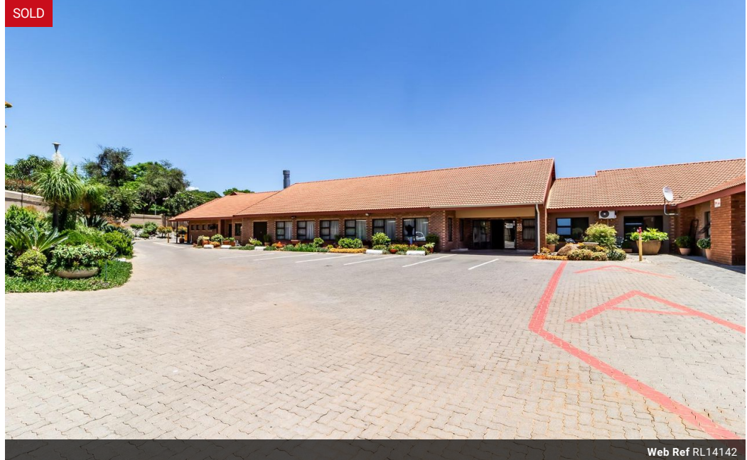
Web Ref RL14142

5 Portofino, 753 Old Farm Road, Faerie Glen Pretoria