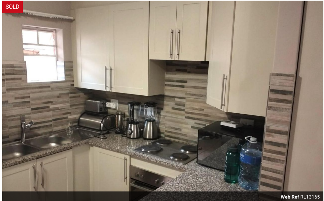
Web Ref RL13165

5 Portofino, 753 Old Farm Road, Faerie Glen Pretoria