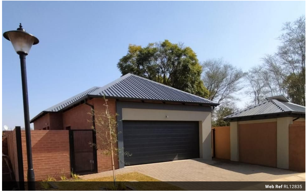
Web Ref RL12835

5 Portofino, 753 Old Farm Road, Faerie Glen Pretoria