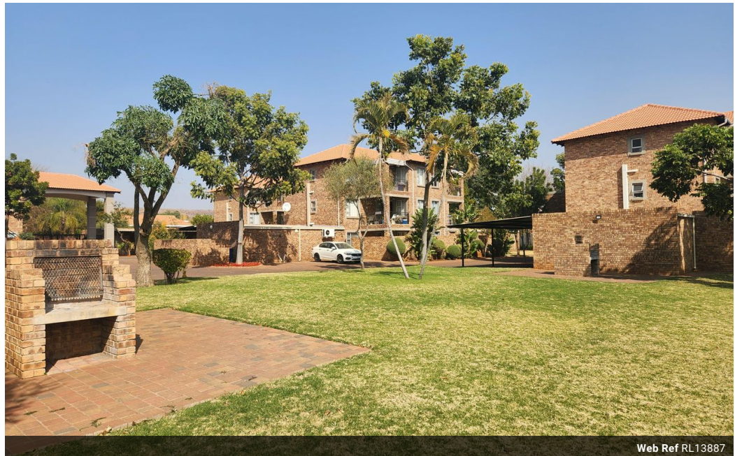
Web Ref RL13887

5 Portofino, 753 Old Farm Road, Faerie Glen Pretoria