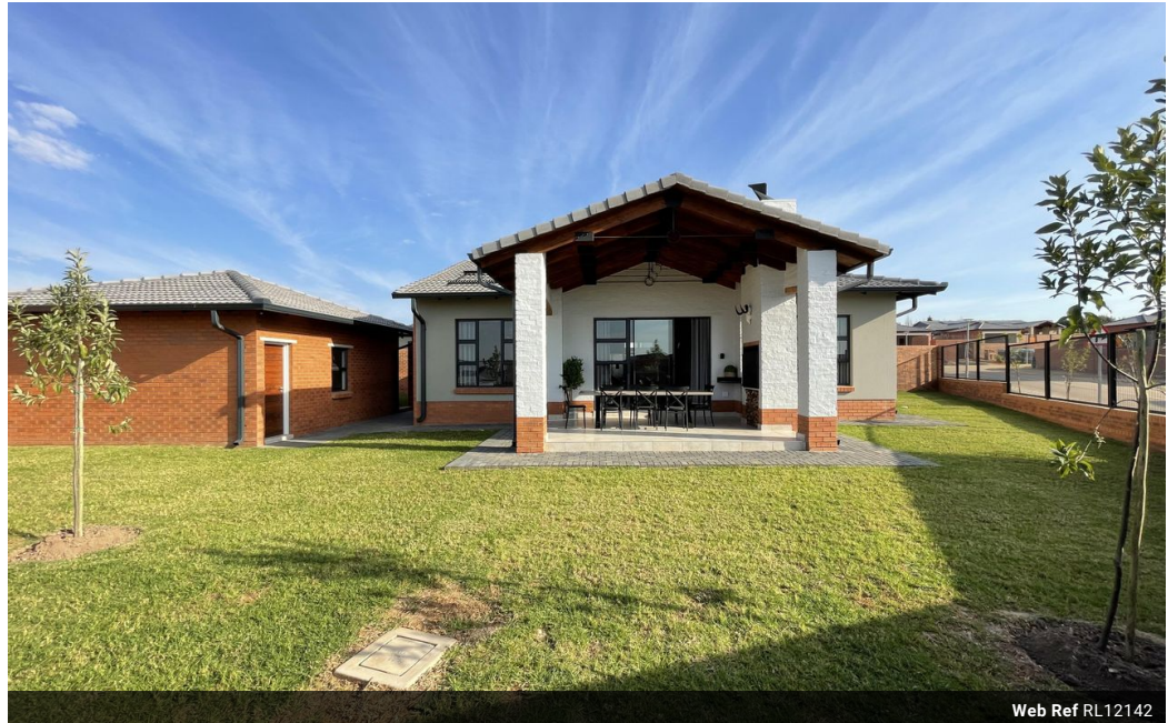
Web Ref RL12142

5 Portofino, 753 Old Farm Road, Faerie Glen Pretoria